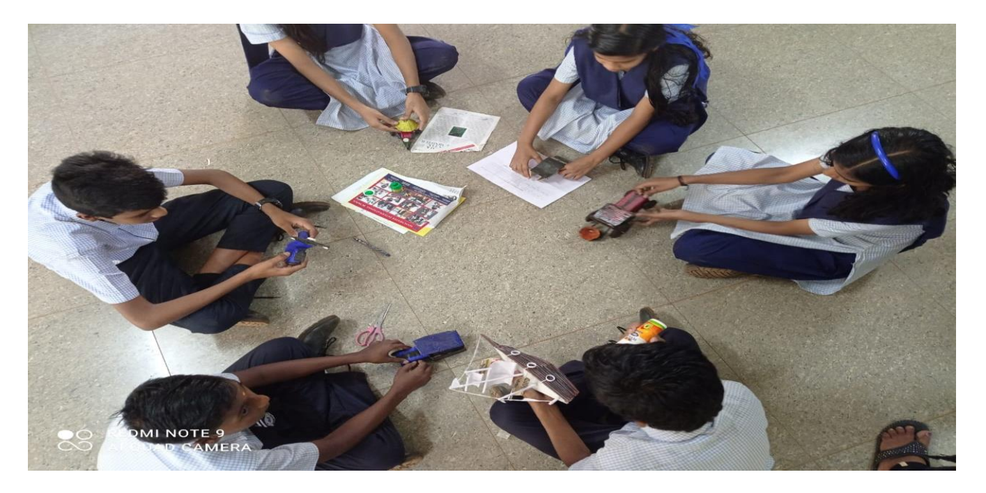
Indigenous Toy Making by students of Class: VIII