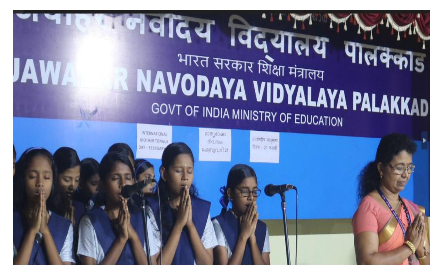
School Choir rendering a Malayalam Patriotic Song