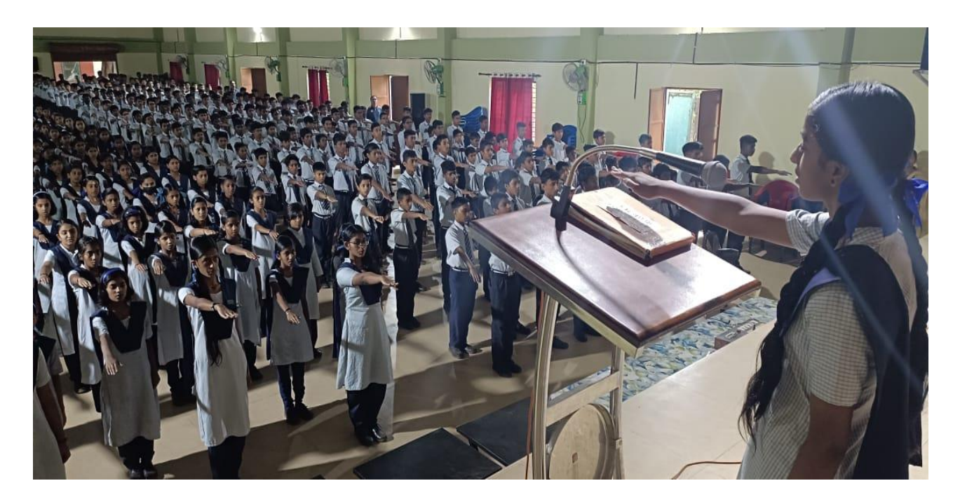
Pledge on Single Use Plastic