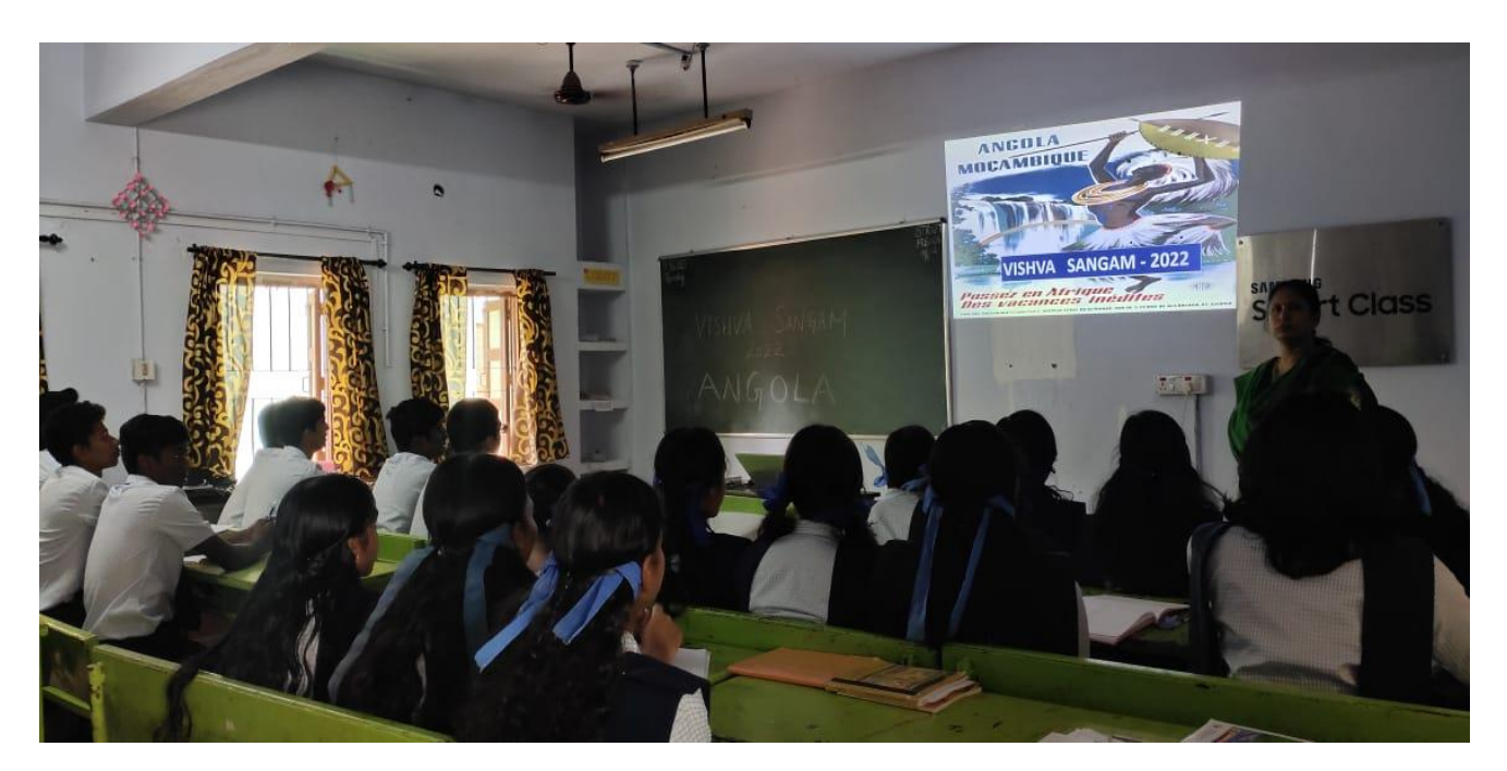
Vishva Sangam – A Slide Show on Angola