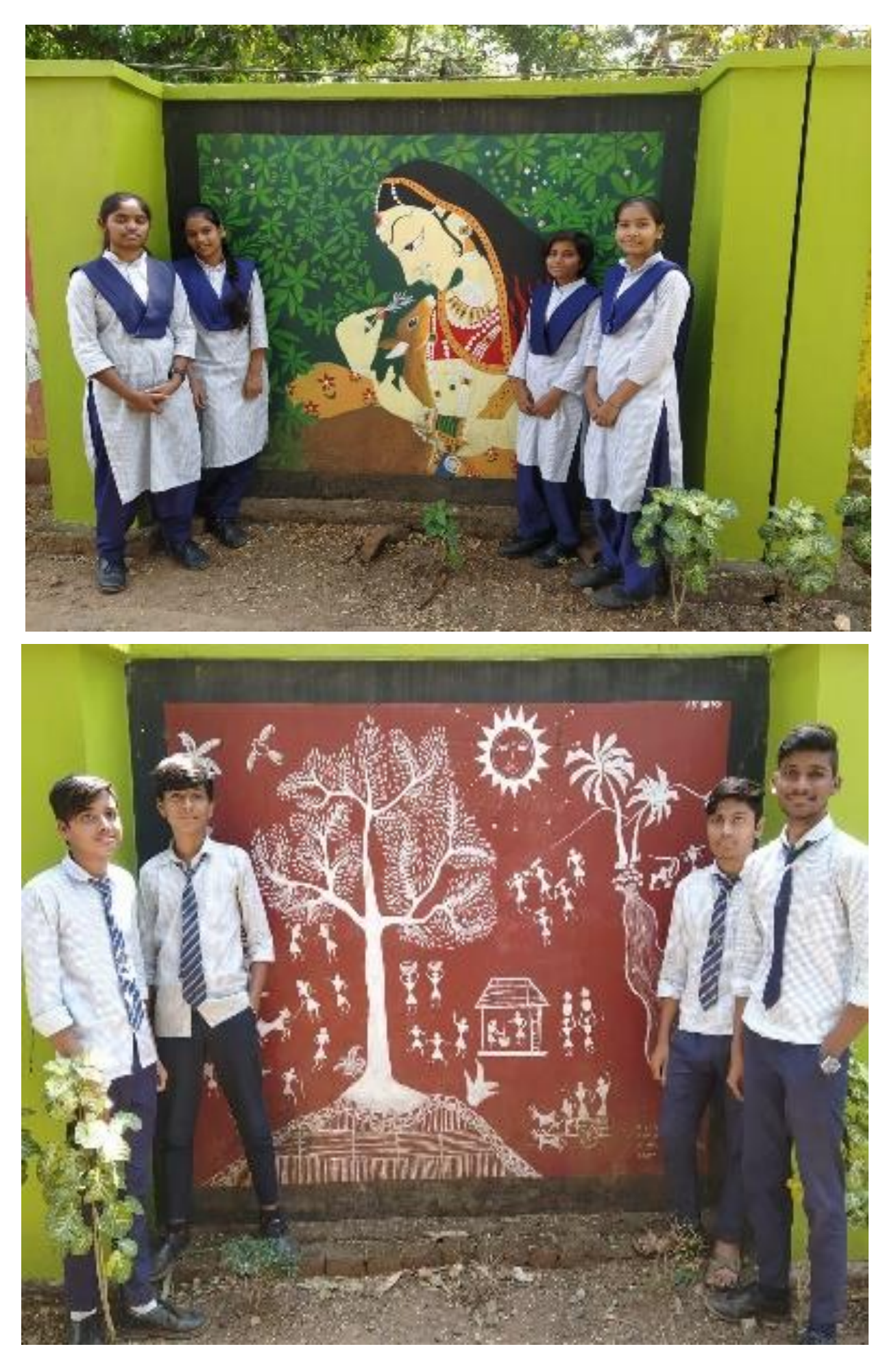
Wall paintings by Migration Students of JNV Jhalawar